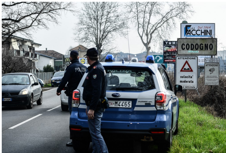
Italian police officers patrol the road into the small northern Italian town of Codogno on February 23, 2020, after it became the centre of a new coronavirus outbreak and worldwide fears over the epidemic spiralled.

Here's a look back at some of the most striking and unforgettable images we've published on The Local during the past year of reporting on lockdowns and other restrictions.