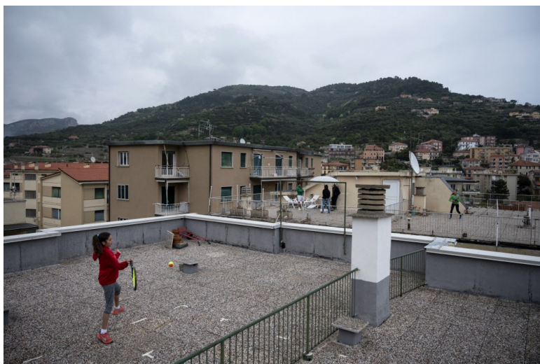
Girls play tennis on the rooftops of their apartment buildings in Liguria on April 19, 2020.

MORE PHOTOS: Silent squares and clear waters as Venice stands empty .