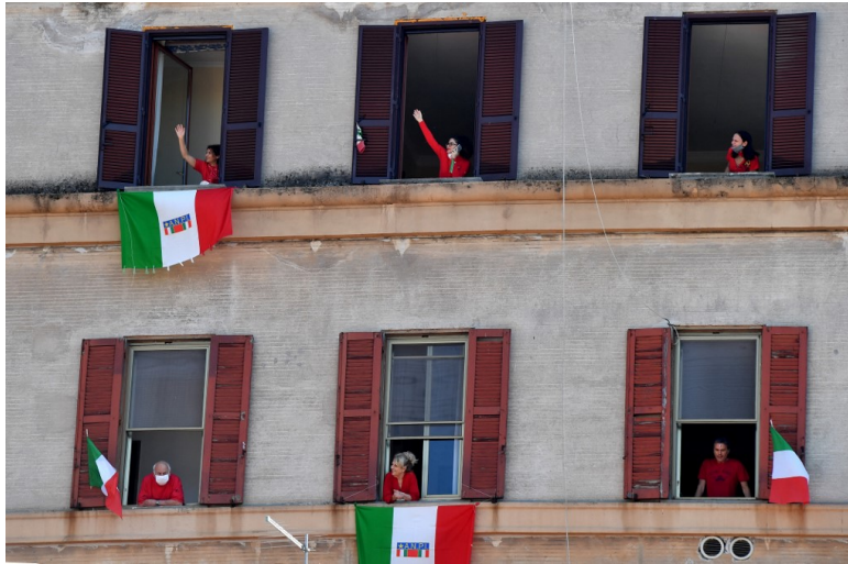
Residents display Italian flags in the Garbatella district of Rome on April 25, 2020 during a Liberation Day musical flashmob, with people singing Italian partisan song 'Bella Ciao' from their windows and balconies.