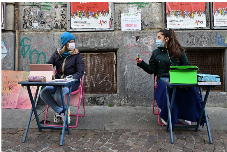
Two 12-year-old students sit outside their school in Turin in November 2020, in protest against closures amid renewed coronavirus restrictions.

A waiter in Florence passes a glass of wine into a building through a buchetta del vino , or wine window – a Renaissance-era tradition revived during lockdown.