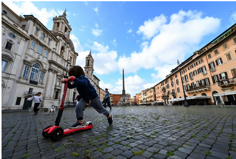
A child rides a scooter as grass is seen growing between cobblestones in Rome's Piazza Navona on April 29, 2020 during the country's ongoing lockdown.