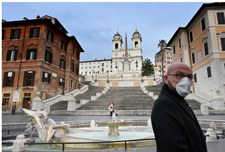
A man wearing a face mask walks by the Spanish Steps at Rome's deserted Piazza di Spagna on March 12, 2020, after Italy shut all stores except for pharmacies and food shops in a desperate bid to halt the spread of coronavirus.