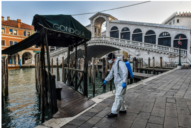
A municipal worker sprays disinfectant around the Rialto Bridge in Venice on March 13th, 2020.