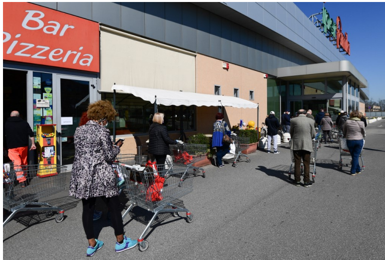
Residents line up at a safety distance as they wait to shop at a supermarket near Milan on March 11, 2020 – a day after Italy imposed unprecedented national restrictions on 60 million people.