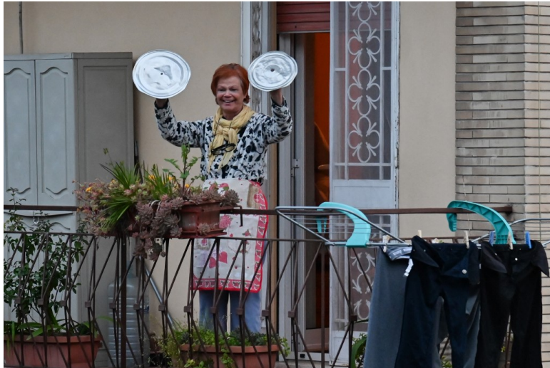
A resident uses pot lids to join in a “noise flash mob” in Rome, aimed at breaking the city’s silence during lockdown.