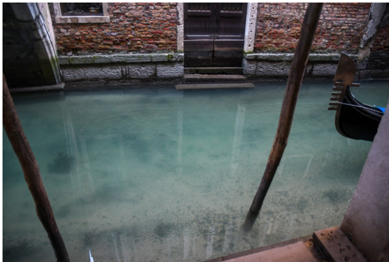
The waters of Venice canals turned clear during lockdown as a result of the stoppage of motorboat traffic.

MORE PHOTOS: Silent squares and clear waters as Venice stands empty .