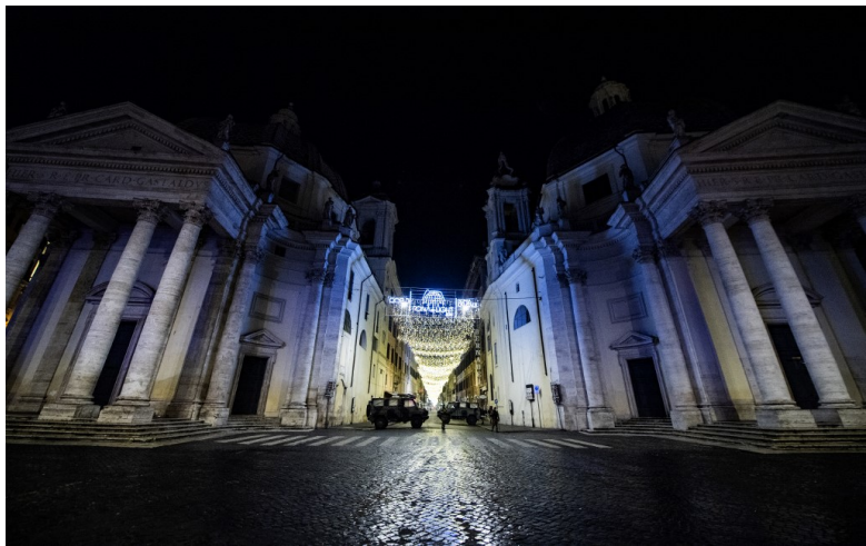
Military vehicles patrol Rome's central Piazza del Popolo on December 31, 2020, as a 10pm-7am curfew is implemented as part of a raft of temporary lockdown measures, intended to ward off a third wave of coronavirus infections.