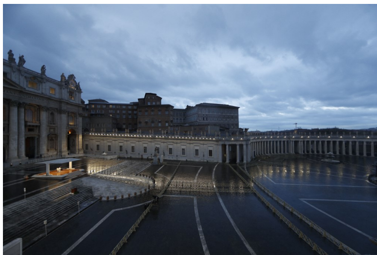
Pope Francis prays in an empty St. Peter's Square in the Vatican on March 27th.